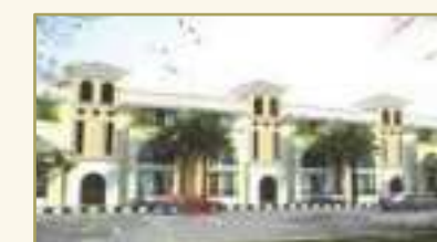
NATURE HUTS 3