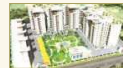
NIRWANA GREENS 4