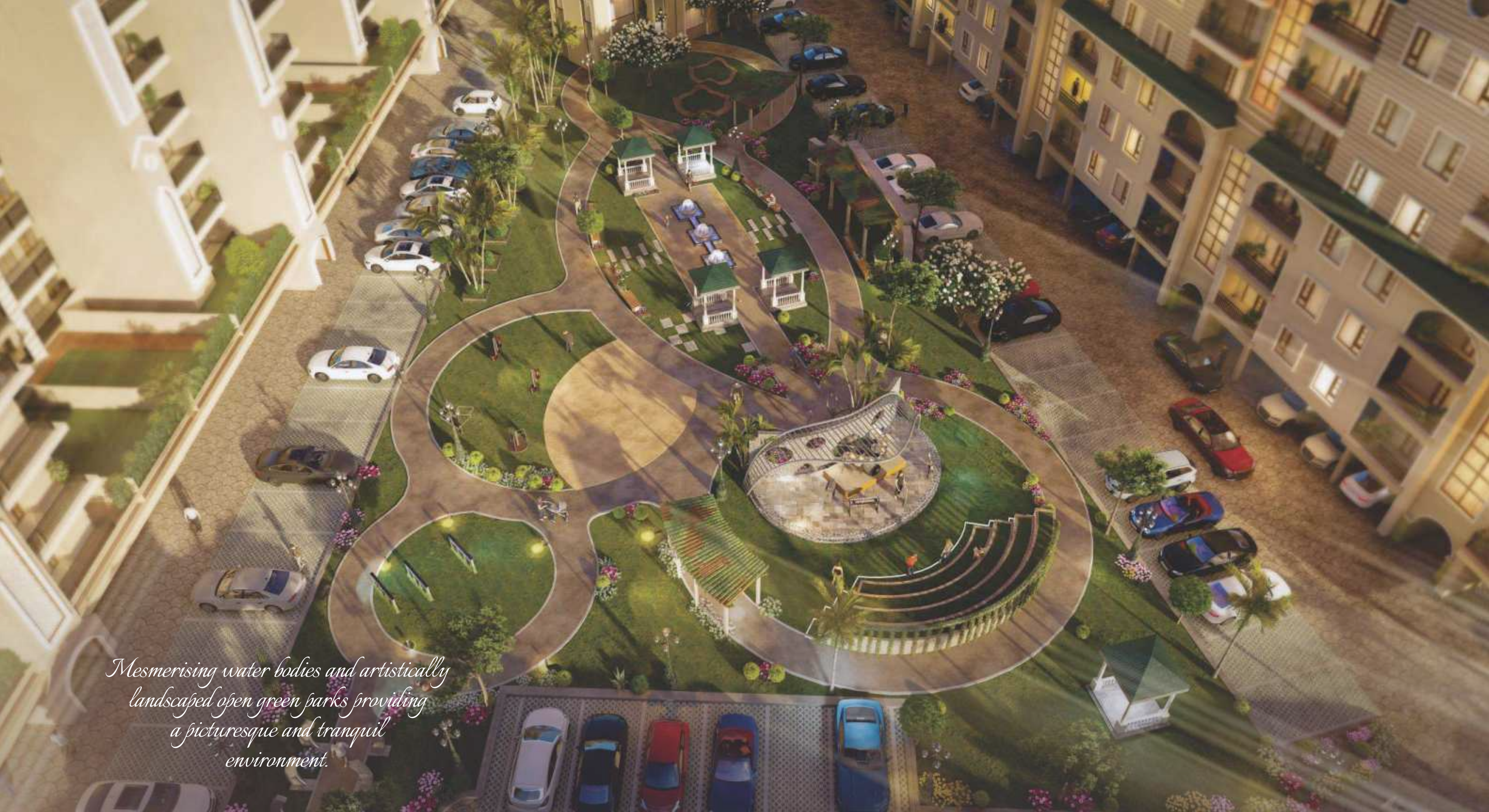
Mesmerising water bodies and artistically landscaped open green parks providing a picturesque and tranquil environment.