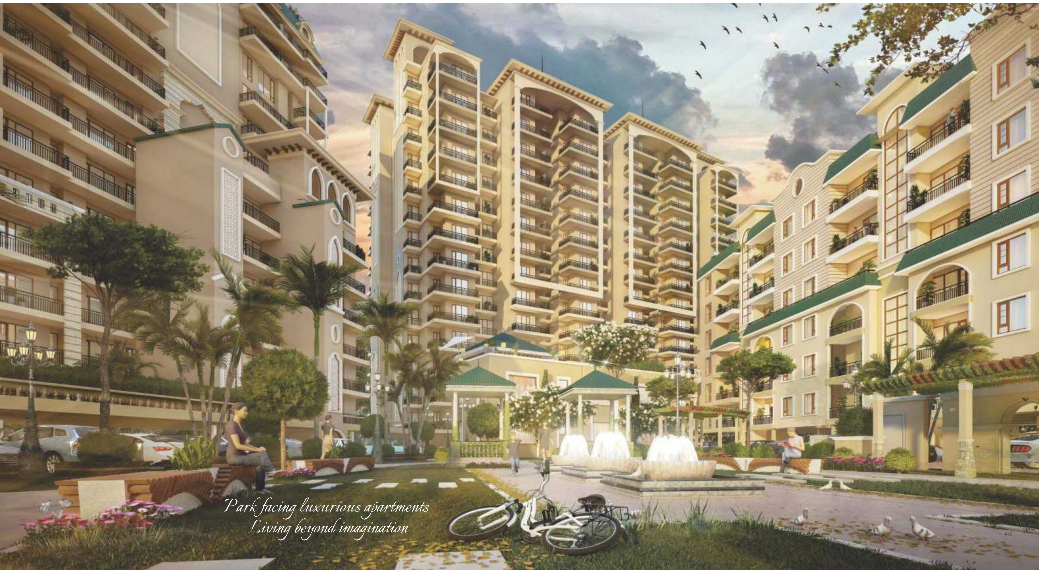
Park facing luxurious apartments Living beyond imagination