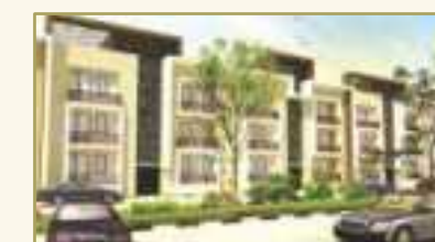
NATURE HUTS 2