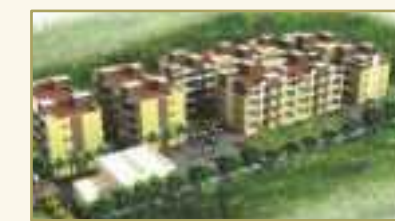
NIRWANA GREENS 2