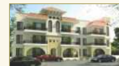
AMARI GREENS EXTN.