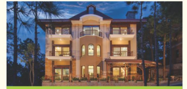
Sanawar Hills - Luxury Villas, Kasauli