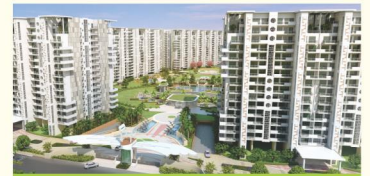
Falcon View Sector 66-A, Mohali