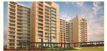
Regency Heights Sector 90, Mohali