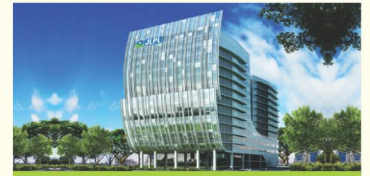
JLPL Twin Towers Sector 66-A, Mohali