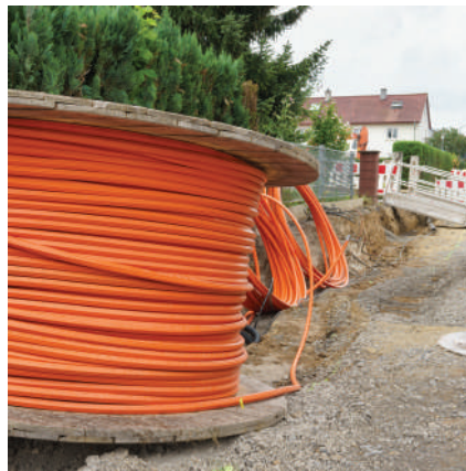
Under Ground Wiring