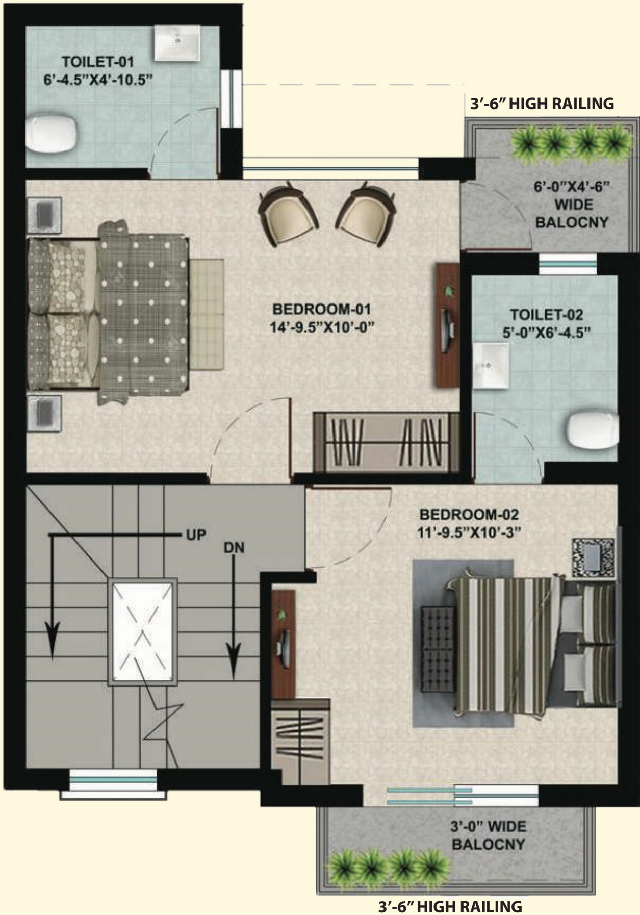
3 BHK VILLA