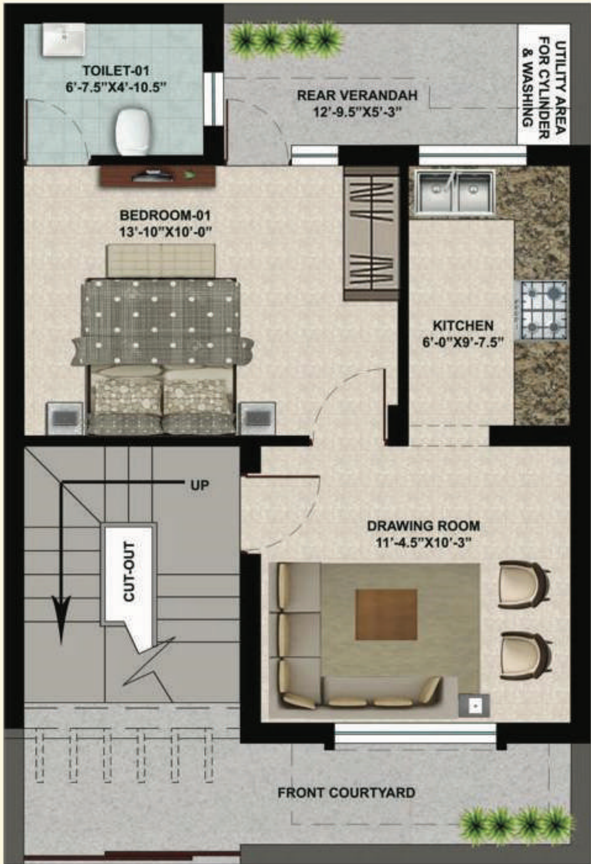
3 BHK VILLA