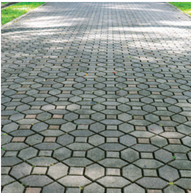
35 ft Eternal Roads