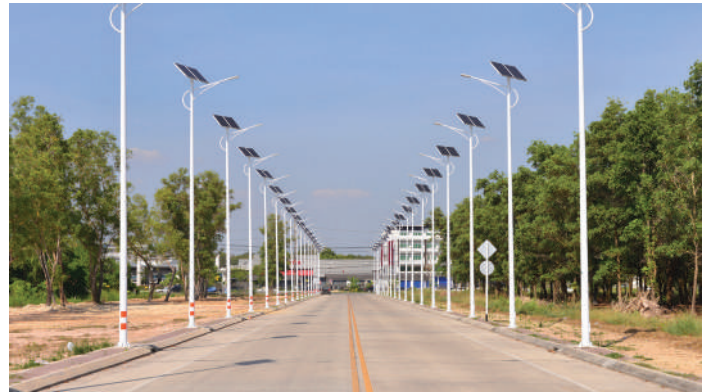
Overlooking 60 ft Main Road