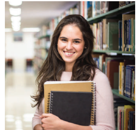
Idol Location for P.G.