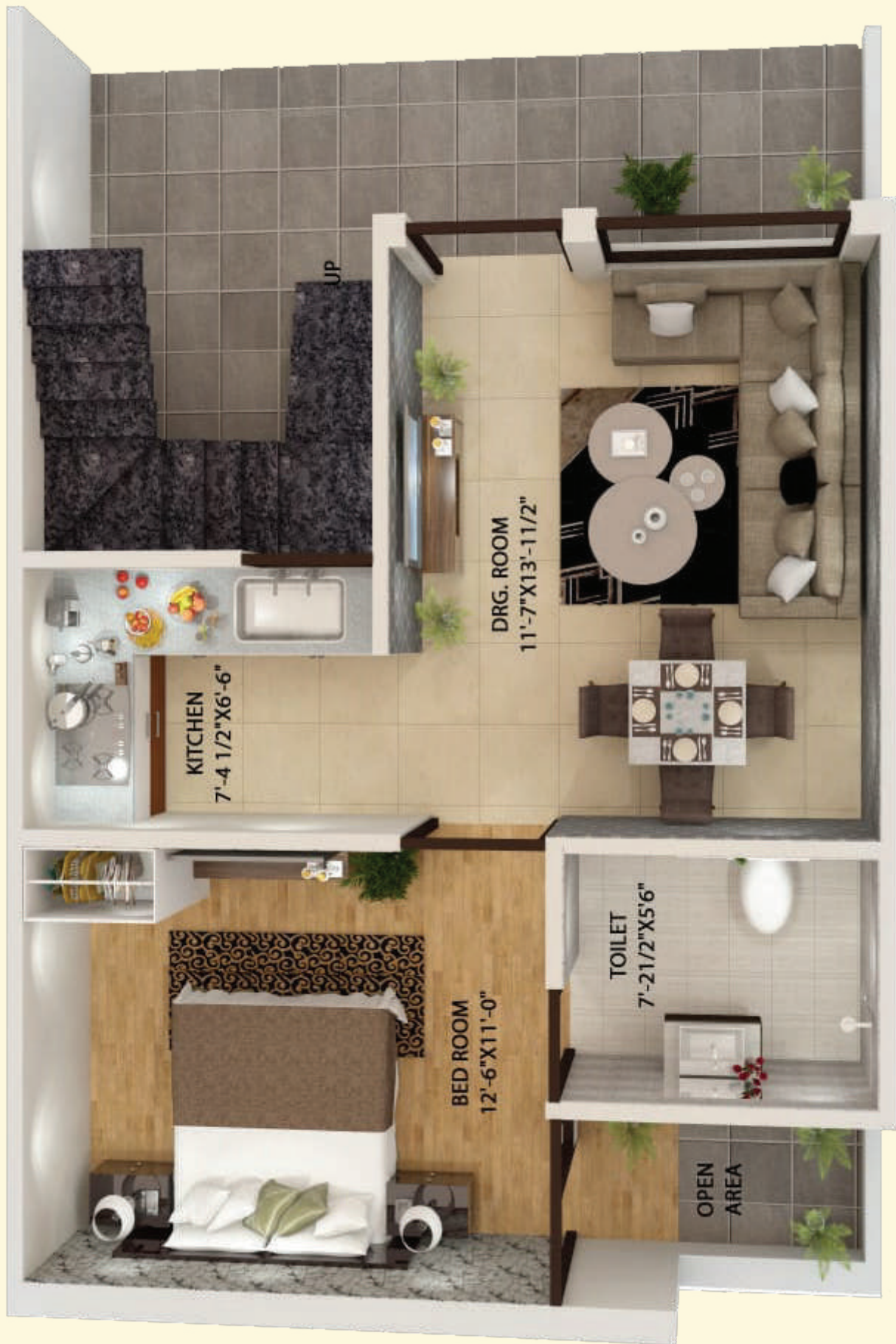
1 BHK FLOOR PLAN (20.9' X 31.5')