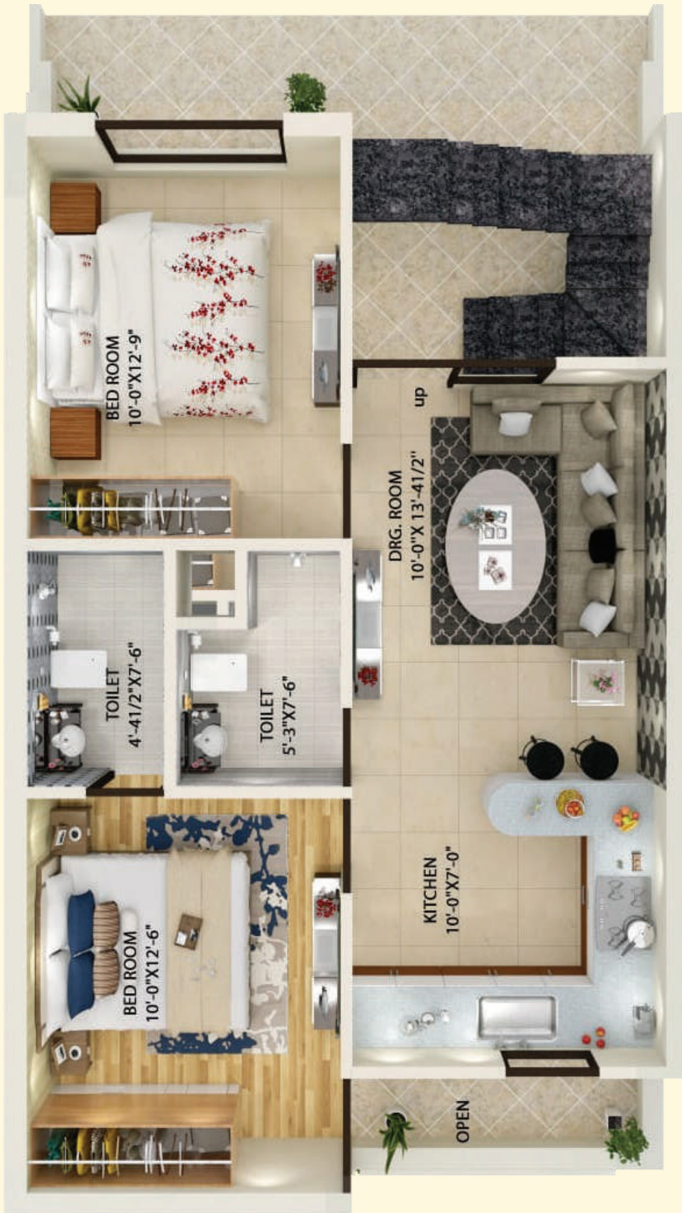
2 BHK FLOOR PLAN (20.9' X 37')