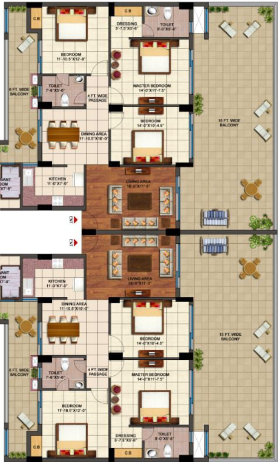
UNIT - 02 - 3 BHK + SERVANT AREA - 2550 SQ. FT.