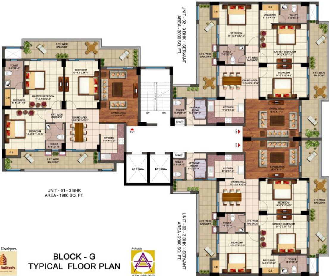
UNIT - 01 - 3 BHK AREA - 1900 SQ. FT.