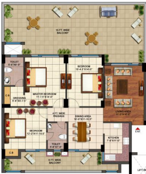
UNIT - 01 - 3 BHK AREA - 2250 SQ. FT.