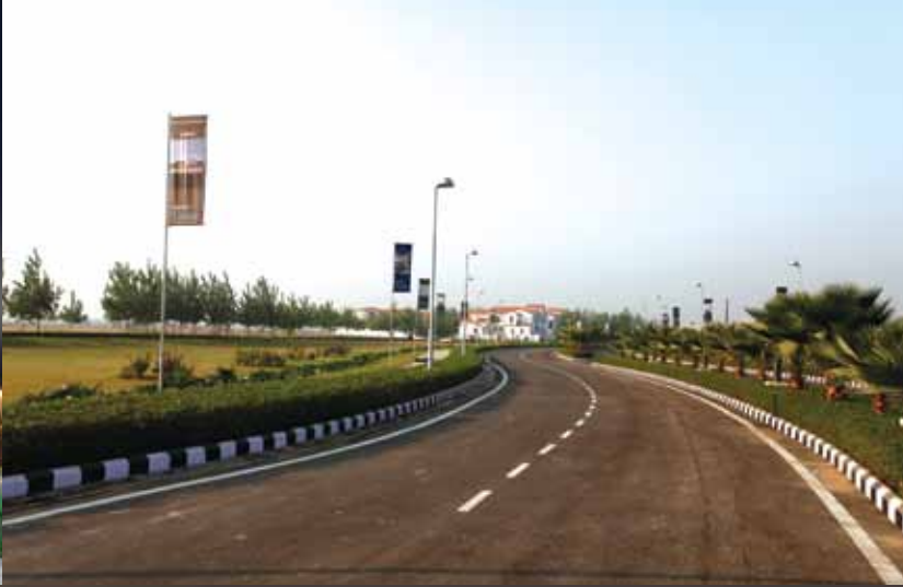
MAIN SPINE ROAD