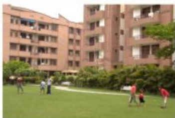
New Generation Apartments