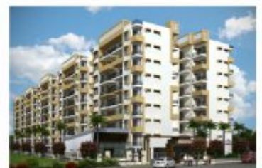
New Generation Maple Apartments