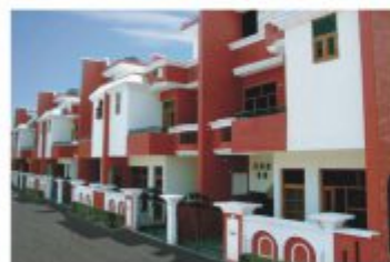
New Generation Independent Duplex Houses