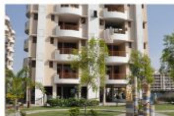
New Generation Extension Apartments